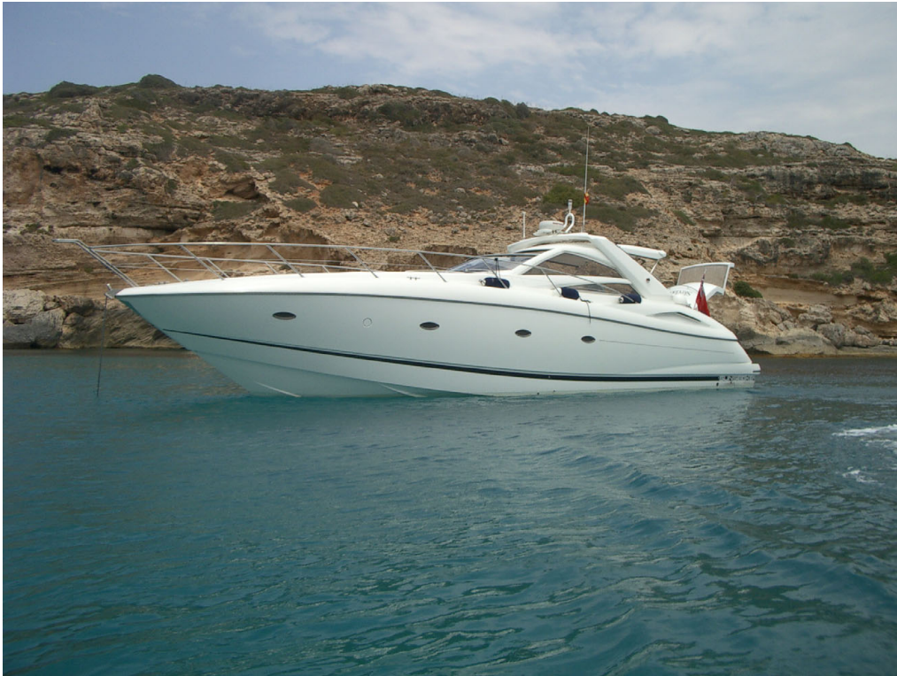
Picture of actual boat

Twin 715 hp Caterpillar C12 shaft drive diesel