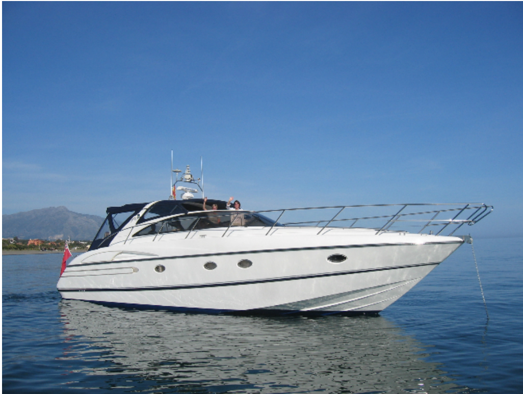
Photo of Similar Boat

Twin 715hp Volvo D12-715 diesel engines on shafts