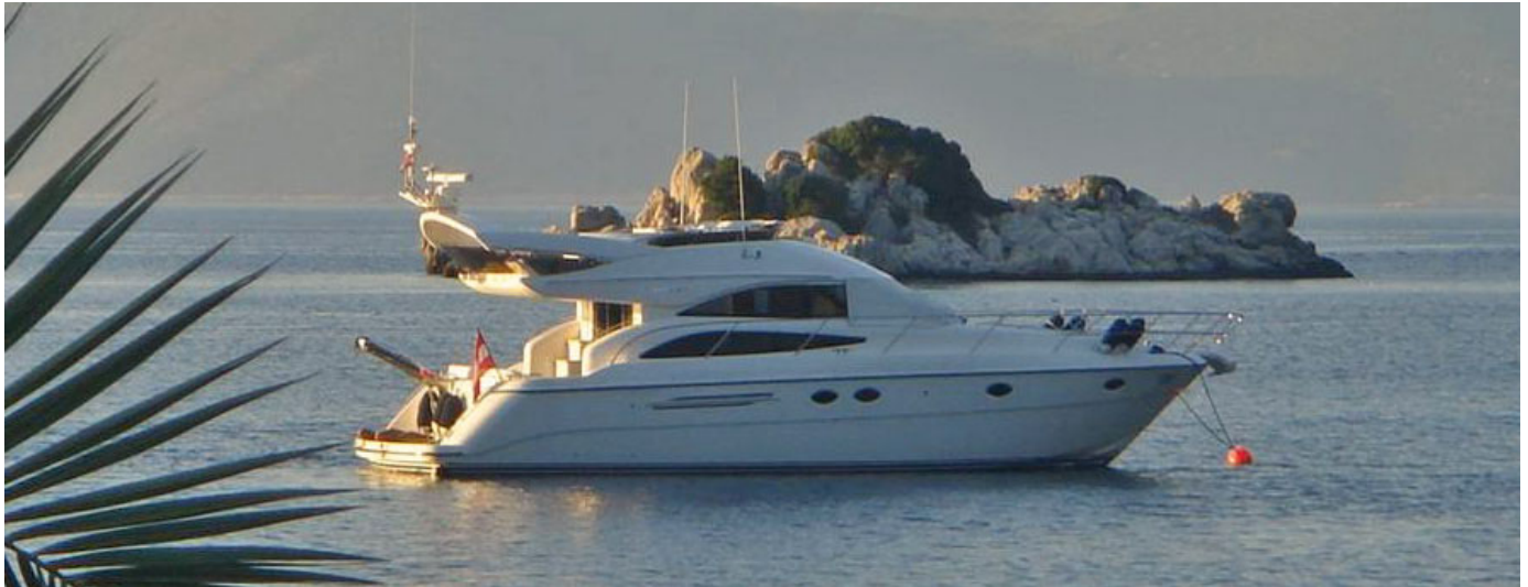
Photo of Actual Boat

Twin 675hp Volvo Penta D12 EDC diesel engines