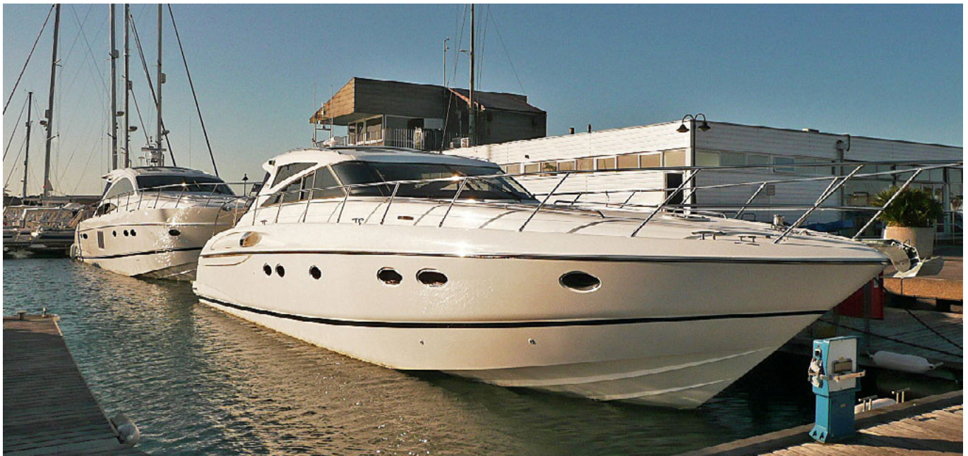
Photo of actual boat