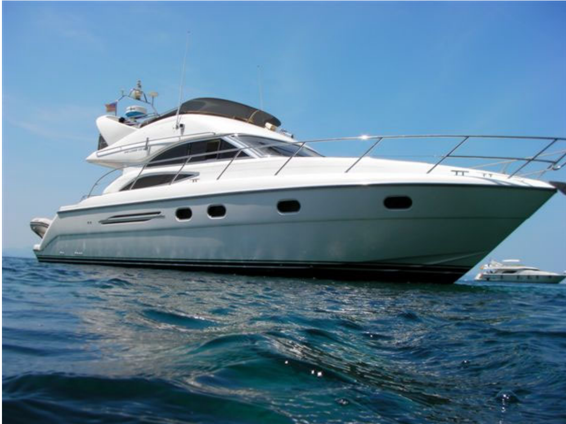
Photo of the actual boat

Twin Volvo TAMD 74 EDC engines on shaft drives