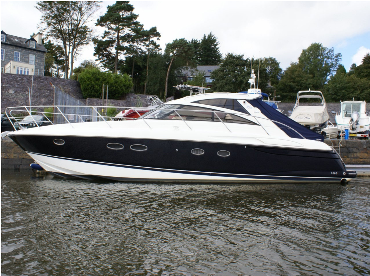
Photo of actual craft

Twin Volvo D9-575HP diesel engines Furuno 1834 colour radar/plotter/GPS Natural high gloss cherry woodwork Hard top with electric sliding roof LCD TV in saloon and DVD player Eberspacher warm air heating Electro-hydraulic passerelle Bow & stern thruster Onan 7kW Generator