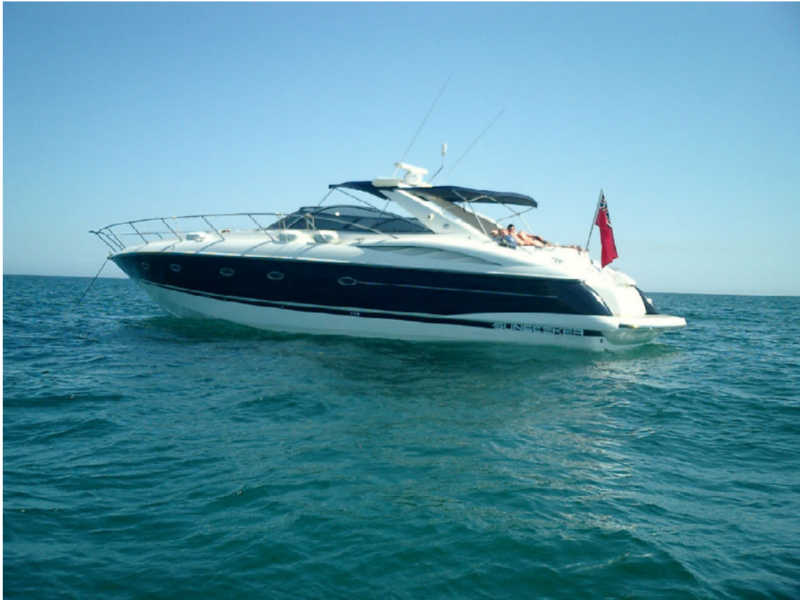
Picture of actual boat

Twin 660 hp Caterpillar 3196 shaft drive diesel