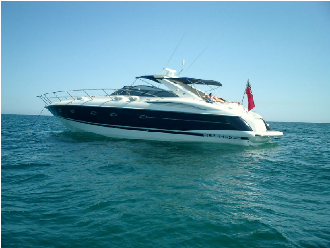
Picture of actual boat

Twin 660 hp Caterpillar 3196 shaft drive diesel Reverse cycle air con Radar/Plotter, GPS, Autopilot Bow thruster Griddle in Cockpit Hydraulic Passerelle 6.5Kw Generator Cream leather interior upholstery