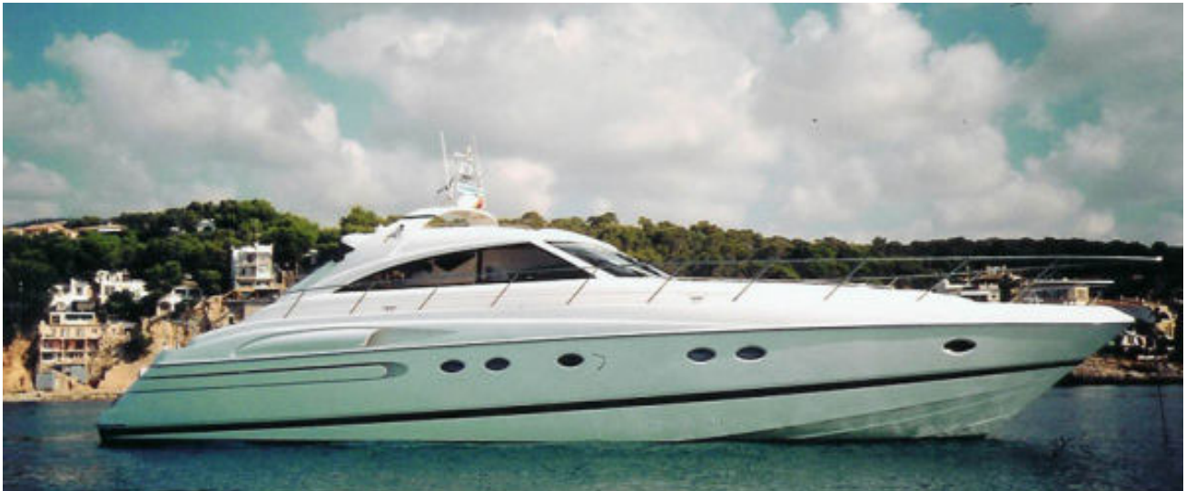
Photo of actual boat