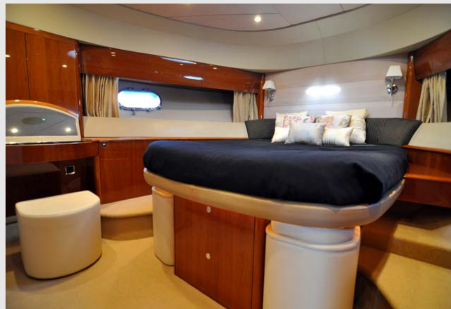
Forward VIP Cabin