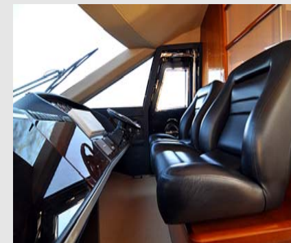
Lower Helm Position