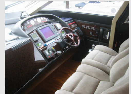
Lower Helm Position