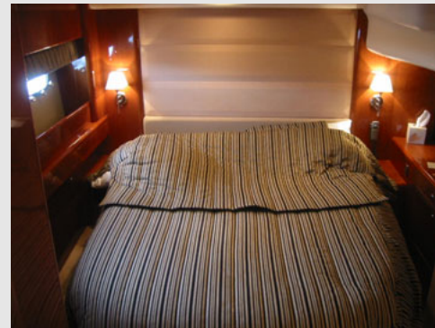
Starboard VIP Cabin