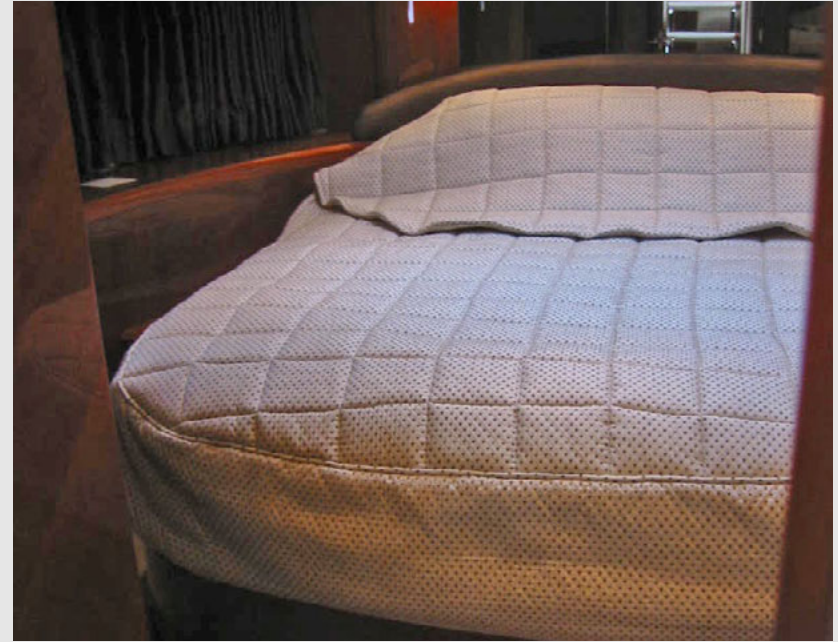
Forward VIP Cabin