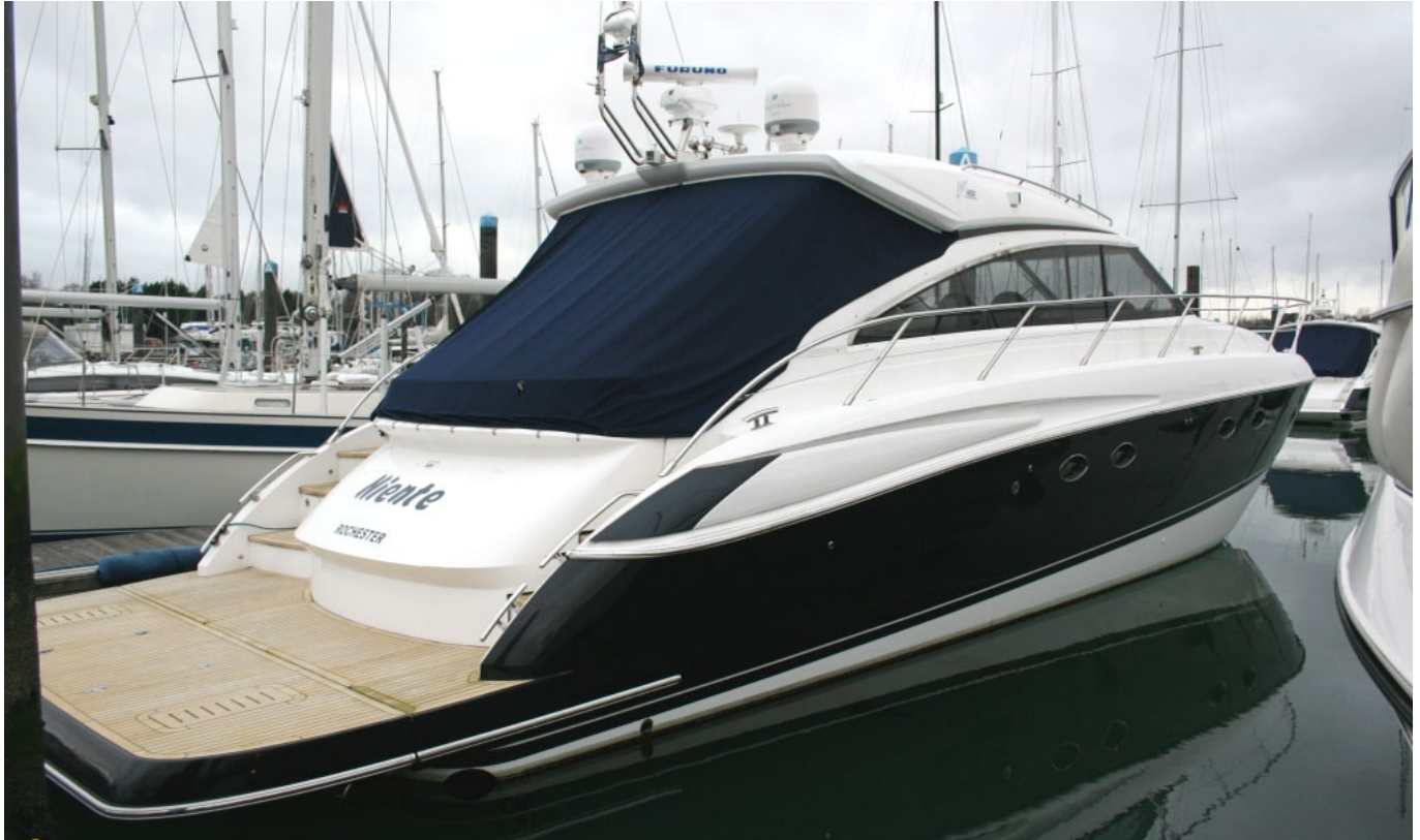
Photo of Actual Craft

Twin Volvo D13-900 engines (900hp each) Electric sliding GRP hard top with glass panels Eberspacher heating to all cabins and WCs Furuno Colour Radar/chart plotter/GPS Cockpit heating system and demisters Custom fit LCD TV in Cockpit Hydraulic Bathing Platform FLIR Night vision Camera Bow & Stern thrusters Bose Sound System KVH Satellite TV