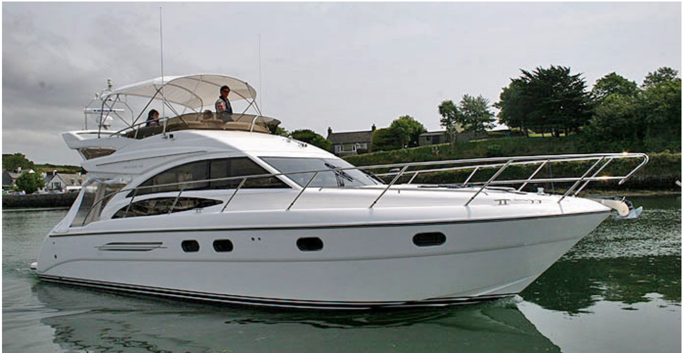
Photo of Actual Boat

Twin TAMD 75P (480hp) Volvo Penta Engines Bow Thruster Furuno NAVnet VX2 Chart plotter / Radar / GPS Eberspacher warm air heating system Onan 9.5kW Generator White flybridge bimini TV in Saloon with DVD System Teak Cockpit & Bathing Platform Toilet Holding Tank Stone Leather Upholstery Natural cherry woodwork