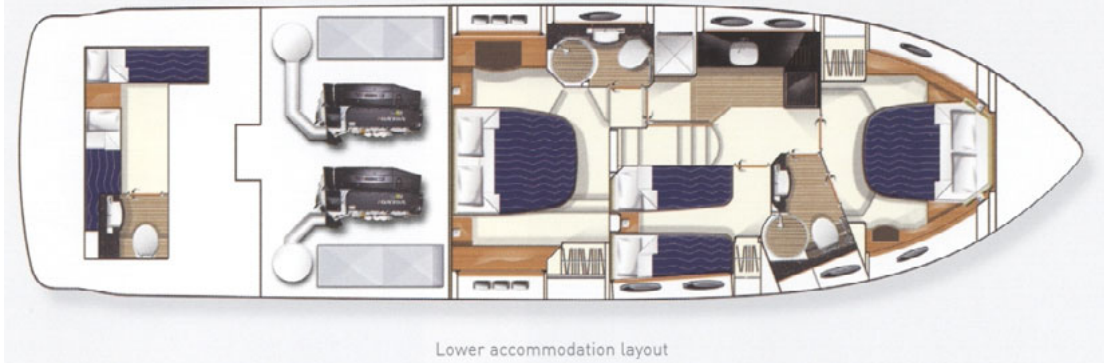
Lower accommodation layout

Whilst every care has been taken in the preparation of these particulars, their correctness is not guaranteed and they are intended as a guide only and do not constitute a part of any contract.