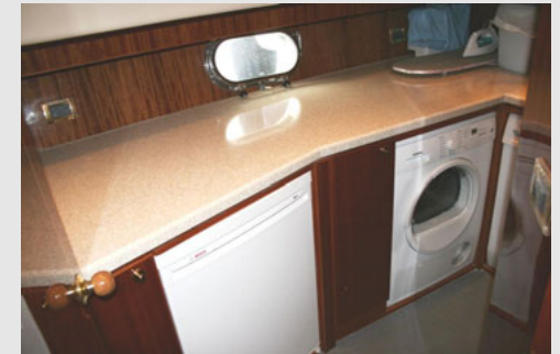
Utility Room (STB)