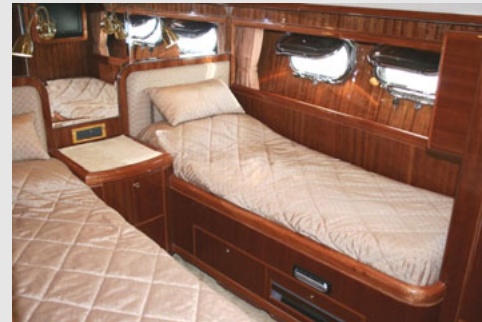
Twin Cabin (Port)