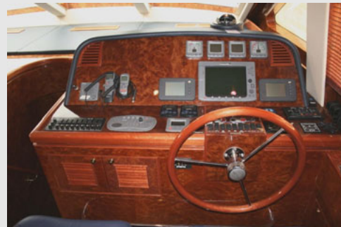
Lower Helm Position