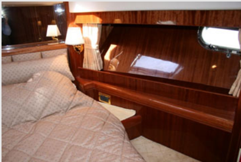
Forward Stateroom Starboard

A spacious forward stateroom has large double bed with opening stainless steel port holes. The Portside twin cabin has two full size single beds with two large portholes. Both cabins feature LCD TVs, DVD players and digital decoder. Both have en-suite bathrooms with granite flooring, vacuum WC & separate thermostatic shower. The utility room and laundry centre, located to starboard, is fully air conditioned and has a Siemens washing machine, Bosch tumble dryer and freezer, with a marble worktop and excellent storage areas.