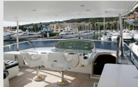
Upper Helm Position