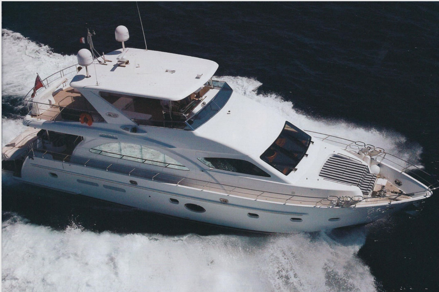
Photo of actual yacht

www.princess.co.uk/pbi ————— pbi@princess.co.uk