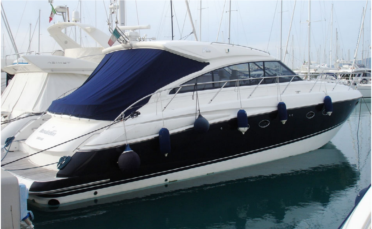
Photo of Actual Boat

Twin Volvo D12-800 engines (775hp each) Electric sliding GRP hard top with glass panels Bow & Stern thrusters with remote controller Furuno NAVnet II Radar/chart plotter/GPS Air conditioning to all cabins and WCs Air conditioning to cockpit and helm Pullman berth in Starboard cabin Onan 13.5kW Generator Foredeck cushions