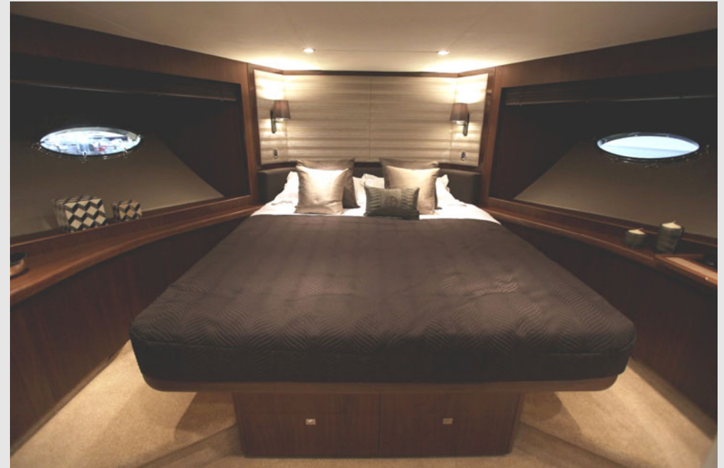
Forward VIP Cabin