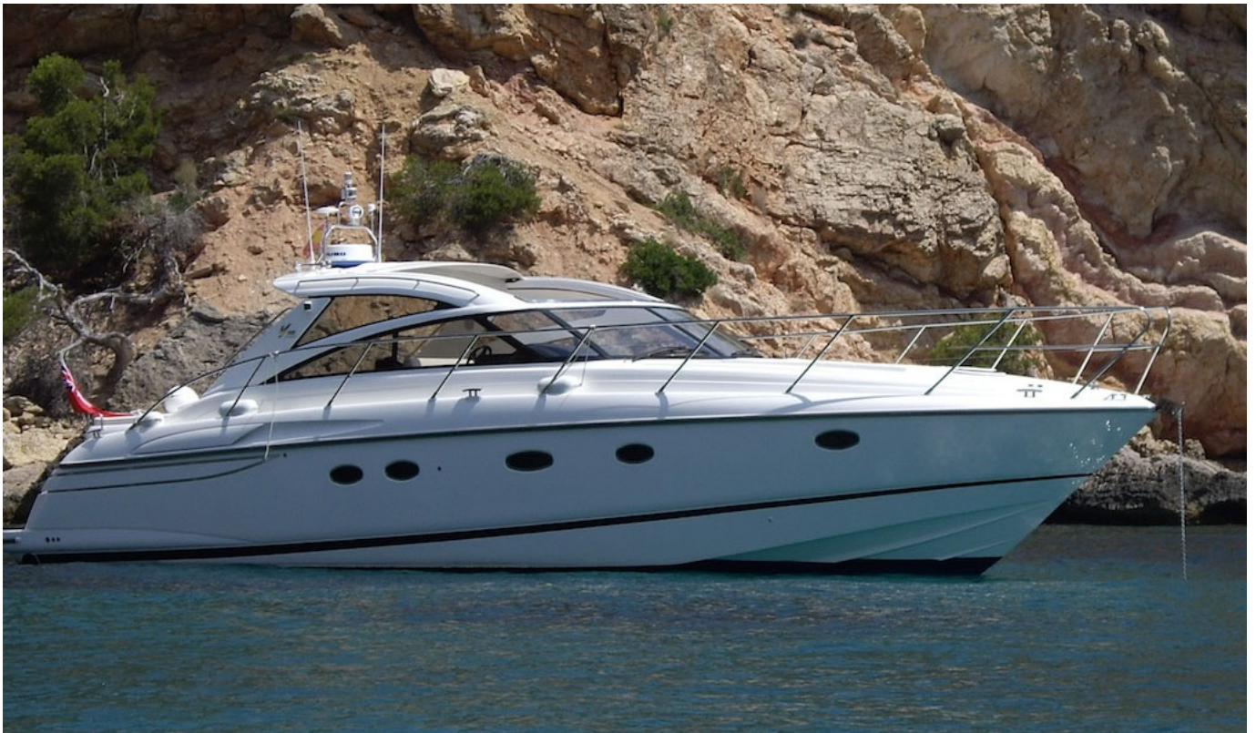
Photo of Actual Boat

Twin Volvo D9-575HP diesel engines Furuno 1834 colour radar/plotter/GPS Natural high gloss cherry woodwork Hard top with electric sliding roof Air-conditioning system Williams 285 Jet boat Onan 7wh Generator