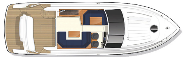
Upper Accommodation Layout