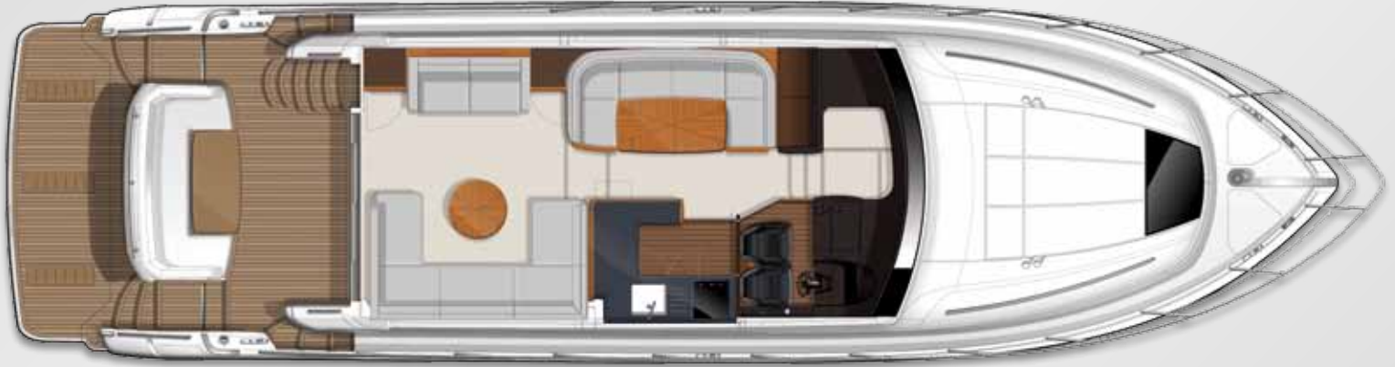
MAIN DECK LAYOUT