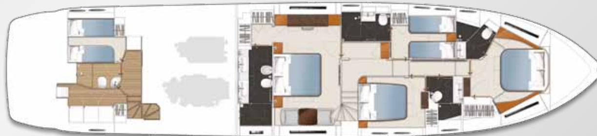
LOWER ACCOMMODATION LAYOUT