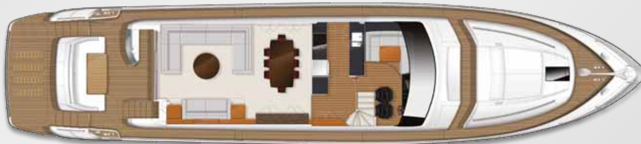
MAIN DECK LAYOUT