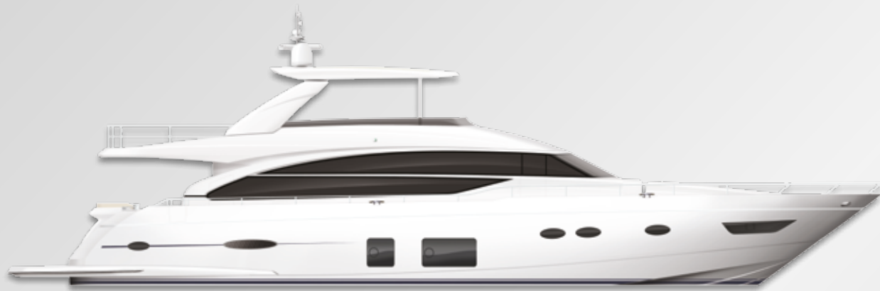
PROFILE (WITH OPTIONAL HARDTOP)