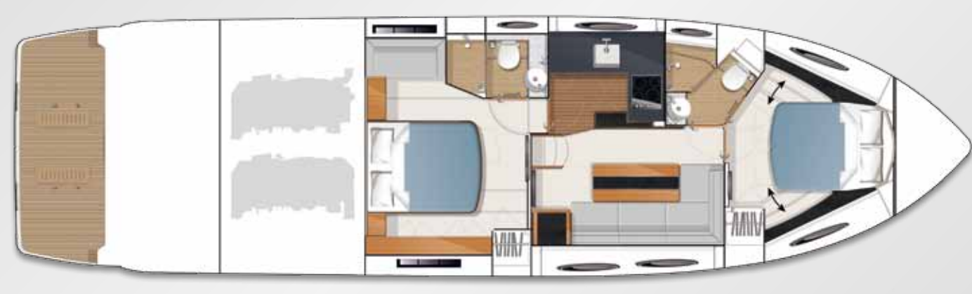
LOWER ACCOMMODATION LAYOUT