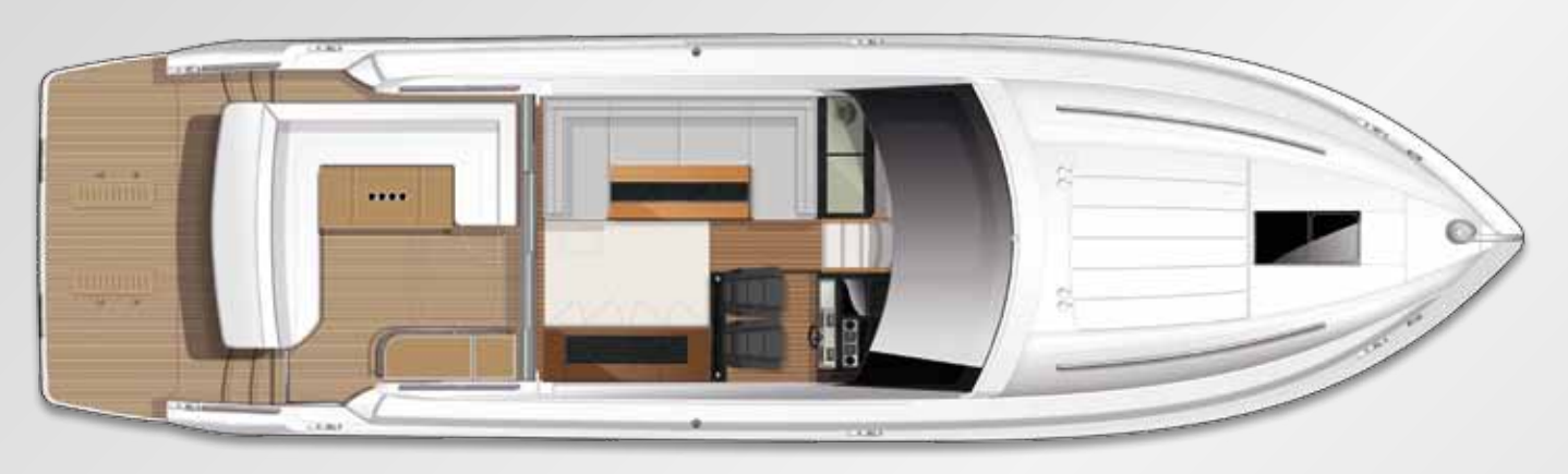
MAIN DECK LAYOUT