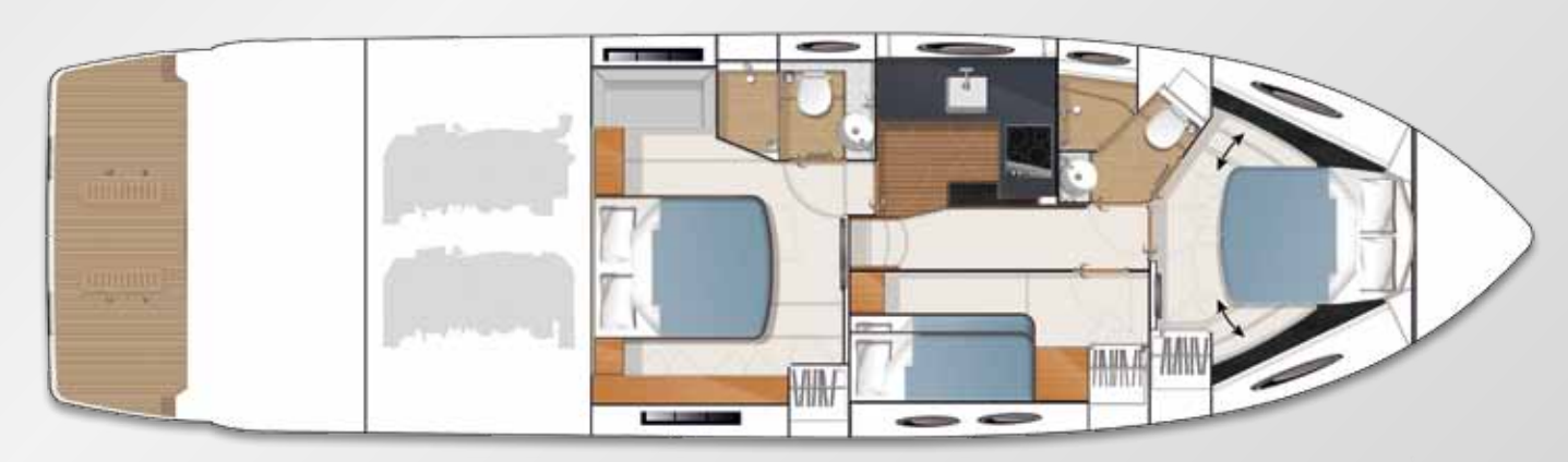
LOWER ACCOMMODATION LAYOUT (WITH OPTIONAL THIRD CABIN)