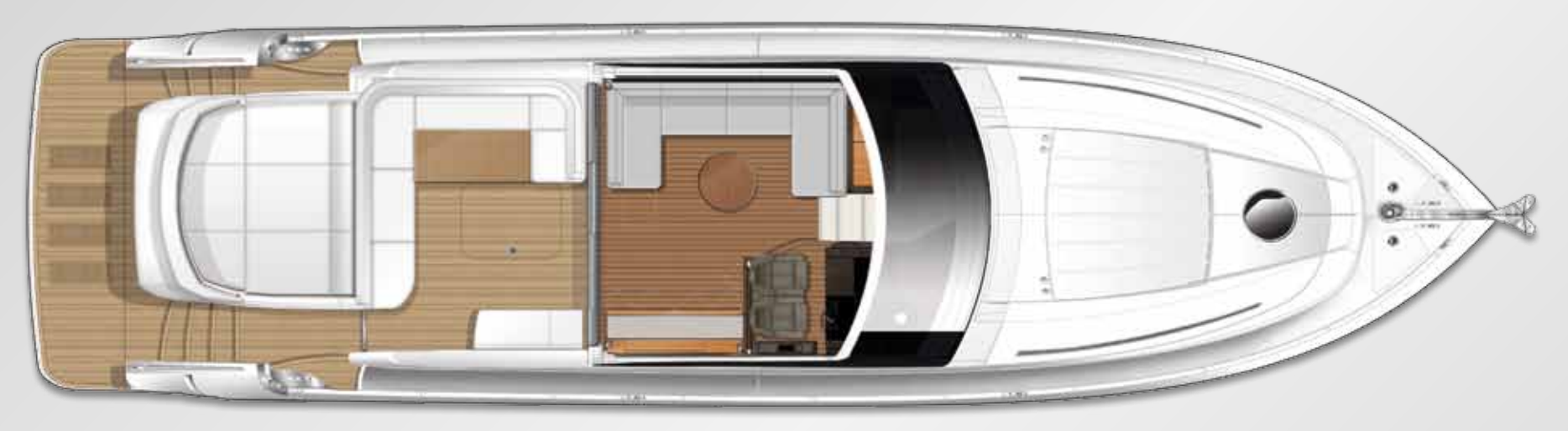
MAIN DECK LAYOUT