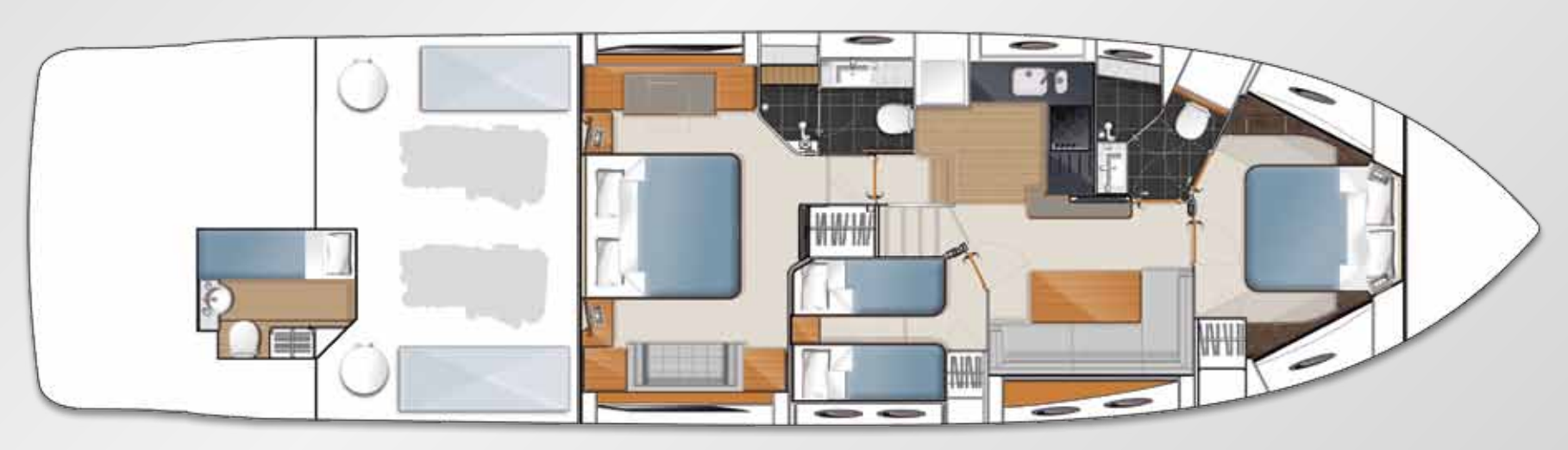
LOWER ACCOMMODATION LAYOUT