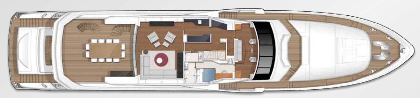
UPPER DECK LAYOUT