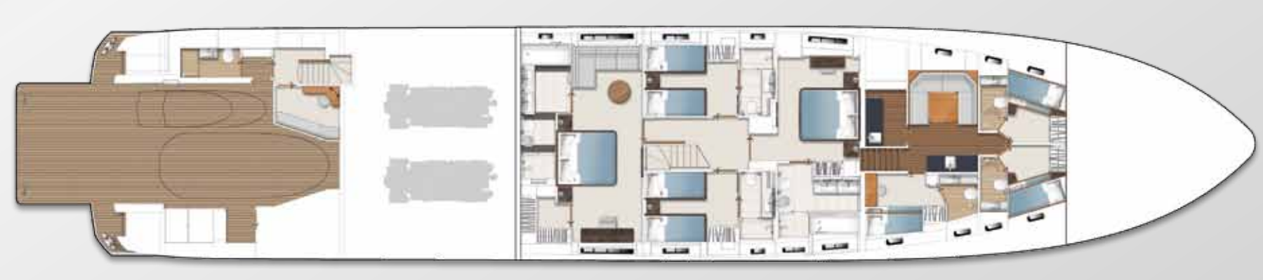
LOWER ACCOMMODATION (4 CABIN) LAYOUT