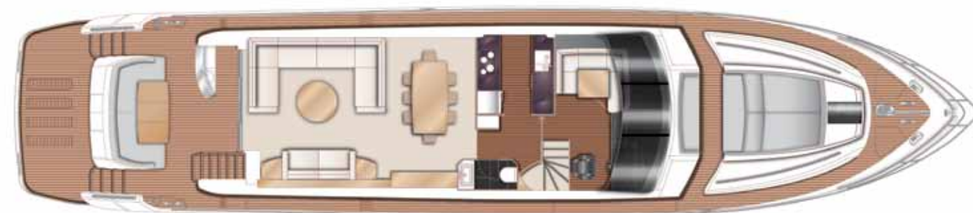
MAIN DECK WITH OPTIONAL DAY HEAD