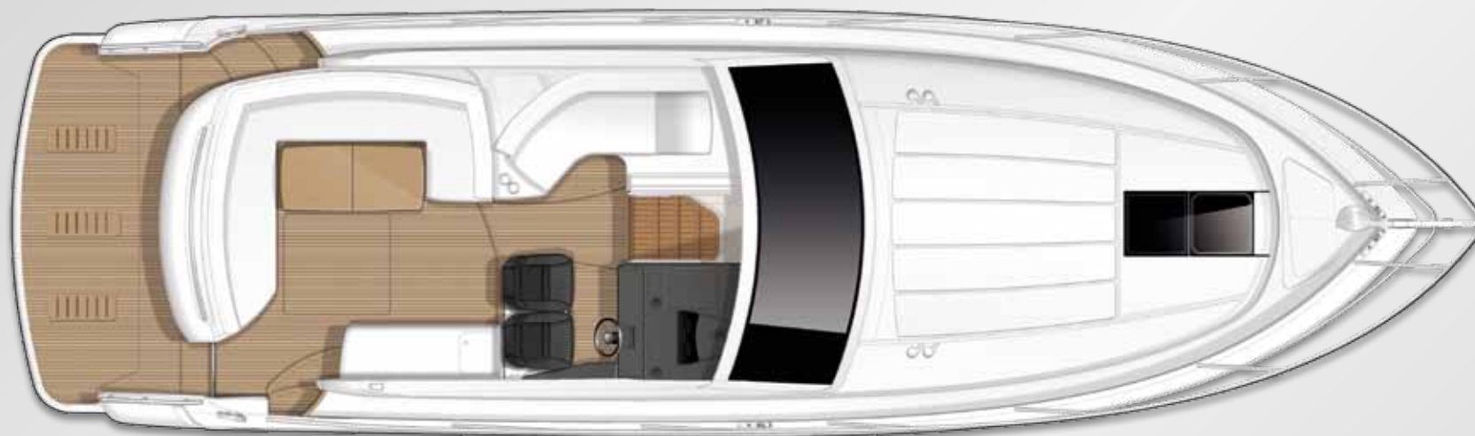
MAIN DECK LAYOUT