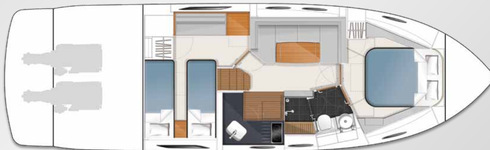
LOWER ACCOMMODATION LAYOUT