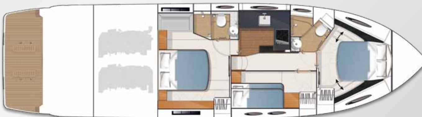
LOWER ACCOMMODATION LAYOUT (WITH OPTIONAL THIRD CABIN)