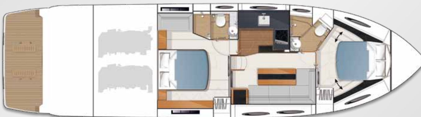
LOWER ACCOMMODATION LAYOUT