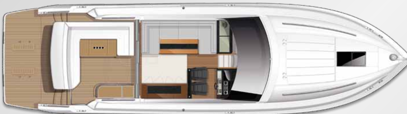
MAIN DECK LAYOUT