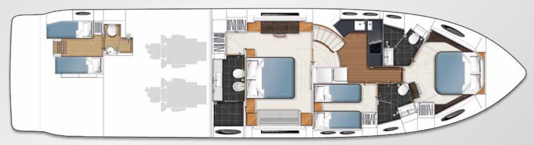
LOWER ACCOMMODATION LAYOUT