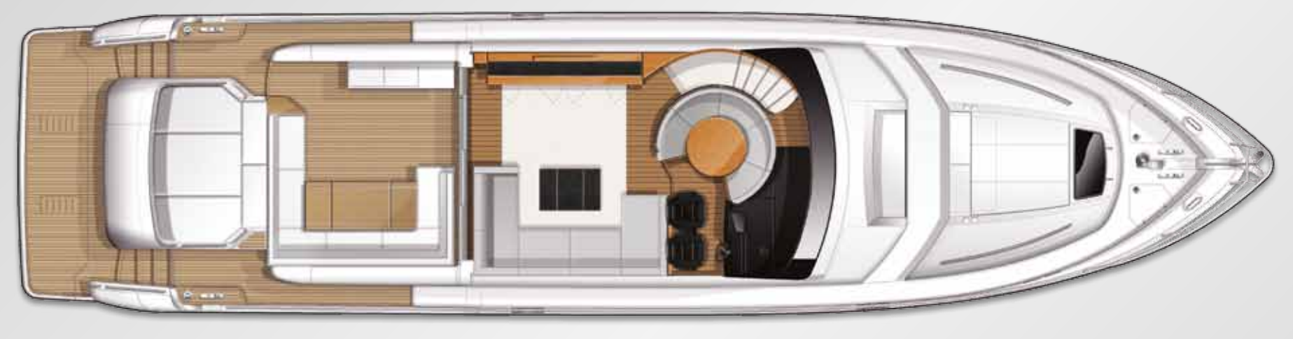
MAIN DECK LAYOUT