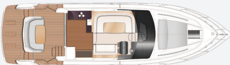
F50 Main Deck