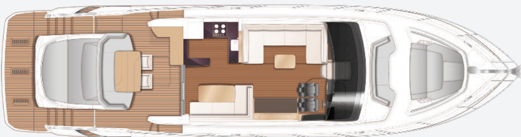
V60 Main Deck