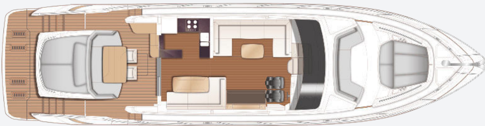
V65 Main Deck