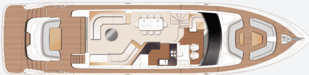
Y80 Main Deck