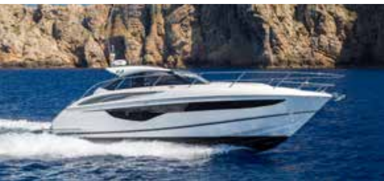
Princess V40 Open

AVAILABLE NOW WITH PRINCESS MOTOR YACHT SALES