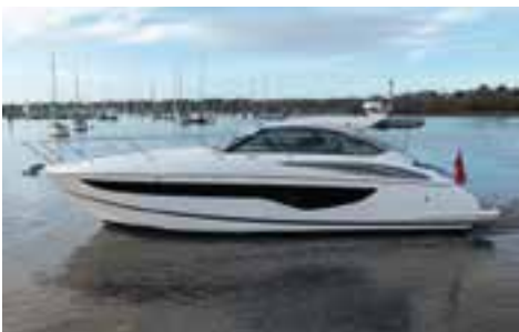
PRINCESS V40 2022