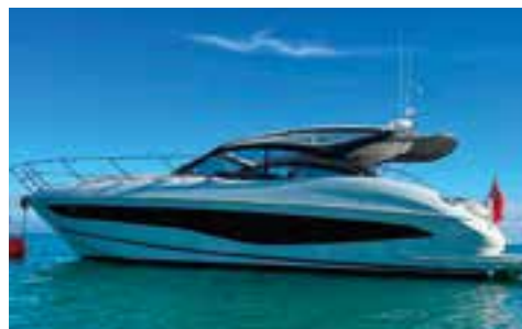
PRINCESS V50 OPEN 2022/23