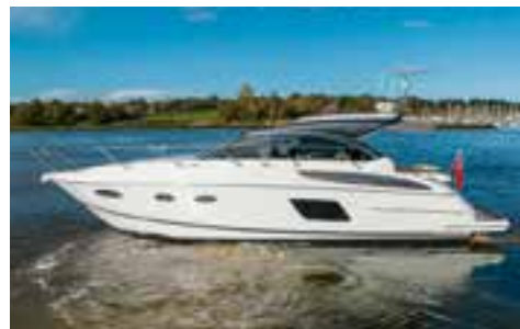
PRINCESS V48 2016