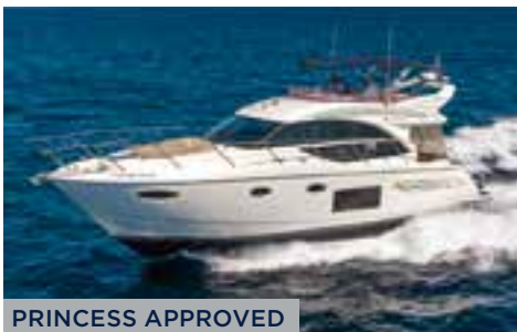
PRINCESS 49 2017