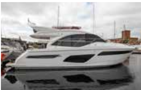
PRINCESS F50 2019/20

£895,000 UK TAX PAID BURNHAM-ON-CROUCH, UK