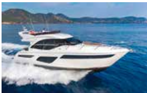
PRINCESS F50 2019

At Princess Brokerage International, our expert team is on hand to give your yacht sale a truly global reach. As the world's largest broker of Princess yachts, our European and international offices have an unsurpassed reputation, taking care of the whole process for you to ensure a quick and efficient sale.