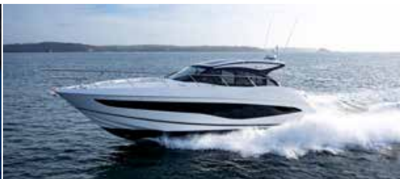
Princess V50 Deck Saloon