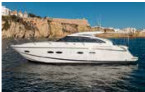
PRINCESS V42 2011