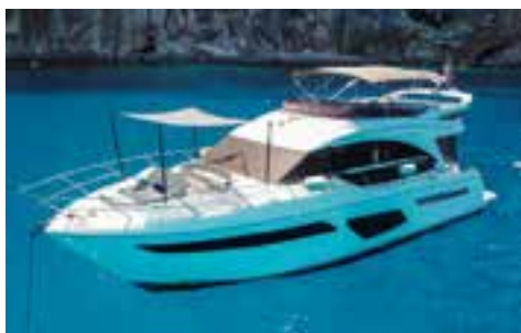
PRINCESS F62 2018