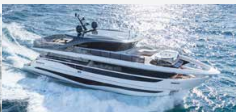
Princess X95 Vista