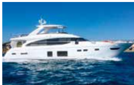
PRINCESS 82MY 2016

£2,495,000 EU TAX PAID VILAMOURA, PORTUGAL