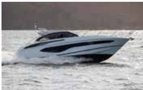
PRINCESS V50 OPEN 2020