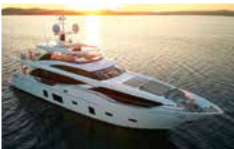
PRINCESS 30M 2020