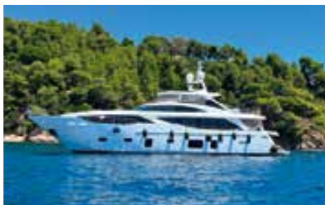
PRINCESS 30M 2019