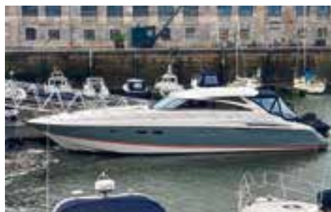
PRINCESS V58 2003