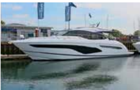
PRINCESS V60 2018