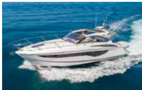
PRINCESS V40 2020